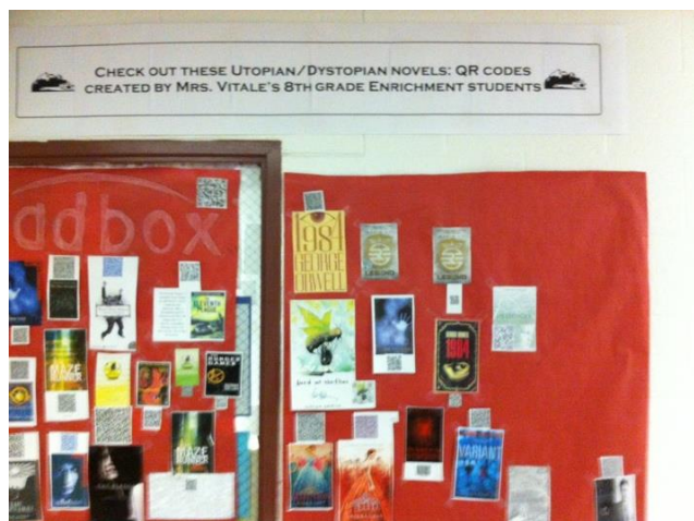
Middle school students use QR codes to review novels

Students have been encouraged to bring their own devices to school since the district's administration unveiled their strategic BYOD plan in June 2012. Since that summer, students