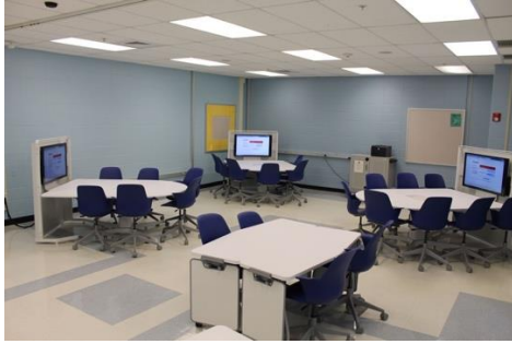
Randolph High School's state of the art collaboration lab

The Randolph community is a supportive environment in terms of innovation. Our board of education and parent organizations have made support of innovation a priority. The community supported the conversion of classroom space in the high school into a state of the art collaboration lab (pictured above) complete with six separate collaboration stations replete with high-definition monitors and BYOD adapters so students can plug their devices in and show their work. Teachers are able to instruct the class on the front LCD projection screen while tables of students work collaboratively to complete projects online using services like Padlet or Google docs to analyze writing. At the push of a button, teachers are able to display exemplary student work to all tables for further review. The collaboration lab is truly an innovative place. These collaboration stations are also available in the high school's media center where students gather to brainstorm and work on project-based learning opportunities.